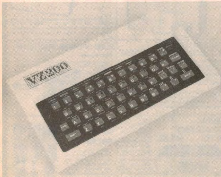
The VZ-200 computer. The keyboard has 45 moving keys with audible feedback.

The VZ-200 includes both an RF modulator (VHF Channel 1) and a direct video output, an unusual feature for a low-cost machine. The video display is produced by a Motorola 6847 Video Display Generator chip with additional circuitry to partly adapt the output to the PAL format. The VDG is designed for 60Hz NTSC operation, and the conver-